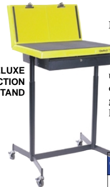
DELUXE INSPECTION STAND

INSPECTION STAND includes a 20" x 26" cushioned work surface and 13" x 26" back display panel with two clips. Deluxe version includes four locking casters, lockable utility drawer, and clear hinged acrylic panels on display panel. Standard model has four glides. Both models have dual column stand. Panels are yellow high impact polystyrene.