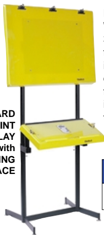
STANDARD BLUEPRINT DISPLAY STAND with WRITING SURFACE

BLUEPRINT DISPLAY STAND plus WRITING SURFACE features a 36"W x 26"H display panel with three clips for "D" size prints. Inclined writing surface includes two clips and hinged and clear document protector. Standard model has four glides on steel stand. Deluxe model includes four casters, lockable tray, side tray, solar powered calculator and clear acrylic cover hinged to back panel. Panels are yellow high impact polystyrene.