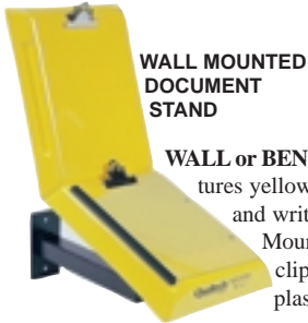
WALL MOUNTED DOCUMENT STAND

WALL or BENCH MOUNTED DOCUMENT STAND features yellow high impact polystyrene document holder and writing surface on heavy duty steel support. Mounts easily to wall or bench top. Includes two clips. 9" x 13" writing surface has hinged, clear plastic document protector.