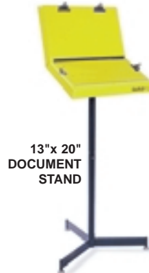
13"x 20" DOCUMENT STAND

DOCUMENT STAND features two 20"W x 13"H panels; a document display board with two clips above an inclined writing surface. Writing surface includes two clips and hinged, clear document protector. Heavy-duty steel stand has three glides. Writing surface is 38" high. Overall height 61". Panels are yellow high impact polystyrene. Also available as wall mounted unit similar to A800W, left.