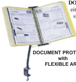
DOCUMENT PROTECTOR with FLEXIBLE ARM

DOCUMENT PROTECTORS are available with either "A" size 8.5" x 11" or "B" size 11" X 17" sheet protectors. Steel protector frames are mounted on 18" flexible arms with clamp that can be easily affixed to desk top or table. Wall mount units include mounting screws and anchors.