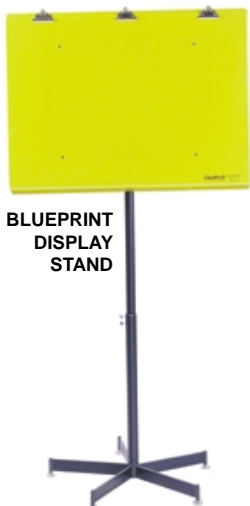
BLUEPRINT DISPLAY STAND

BLUEPRINT DISPLAY STAND features 36"W x 26"H panel with three clips for "D" size prints. Base has five legged steel stand with glides. Panel is yellow high impact polystyrene.