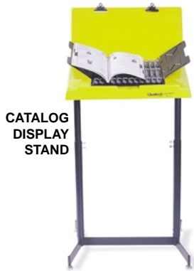
CATALOG DISPLAY STAND

CATALOG DISPLAY STAND makes an ideal reference center for product catalogs, specification sheets or repair manuals. Angled lower panel has twelve 1" three ring binder sections. Back 13" x 26" display panel includes two clips. Sturdy steel stand has dual columns and four feet with glides. Panels are yellow high-impact polystyrene.