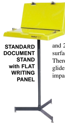
STANDARD DOCUMENT STAND with FLAT WRITING PANEL

DOCUMENT STAND with FLAT WRITING PANEL , is available in two sizes. Model A2000S has two 26"W x 13"H panels. Model A2500S features a 26"W x 20"H back panel for "C" size documents and 26" x 13" writing panel. Both models have a writing surface with two clips and hinged, clear document protector. There are two clips on the back panel. Stand has three glides. Writing surface is 38" high. Panels are yellow high impact polystyrene.