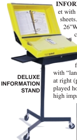
DELUXE INFORMATION STAND

INFORMATION STAND features a 4" deep drop pocket with 3-ring binder mechanism that will hold up to 250 sheets. Binder pocket has hinged, clear plastic cover. 26"W x 13"H inclined writing surface includes two clips and hinged, clear document protector. Standard model includes steel pedestal with glides. Deluxe unit includes casters, lockable tray, and side tray. Writing surface is 38" high. Also available with "landscape" drop pocket panel, shown at right (panel is vertical so pages are displayed horizontally). Panels are yellow high impact polystyrene.