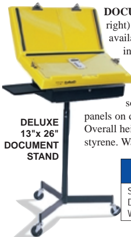
DELUXE 13"x 26" DOCUMENT STAND

DOCUMENT STAND , larger than the A900S (above, right) features two 26"W x 13"H panels. It is also available in a Deluxe version. All models have a writing surface with two clips and hinged, clear document protector. Standard model has three glides. Deluxe model includes three locking casters, lockable tray beneath writing panel, side tray, solar powered calculator, and clear hinged acrylic panels on display panel. Writing surface is 38" high. Overall height 61". Panels are yellow high impact polystyrene. Wall mounted unit also available.