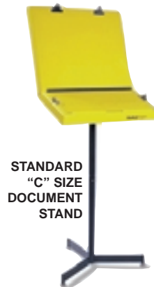
STANDARD "C" SIZE DOCUMENT STAND

Even larger DOCUMENT STAND features 26"W x 20"H back display panels designed for "C" sized drawings. Writing panel is 26" x 13". Includes writing surface with two clips and hinged, clear document protector. Stand has three glides. Writing surface is 38" high. Overall height 61". Panels are yellow high impact polystyrene.