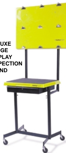
DELUXE LARGE DISPLAY INSPECTION STAND

DELUXE LARGE DISPLAY INSPECTION STAND features 36"W x 26"H display panel with nine clips and 20" x 26" cushioned flat work surface. Deluxe model (standard model is not available) includes four casters on dual column stand and lockable utility drawer. Panels are yellow high impact polystyrene.