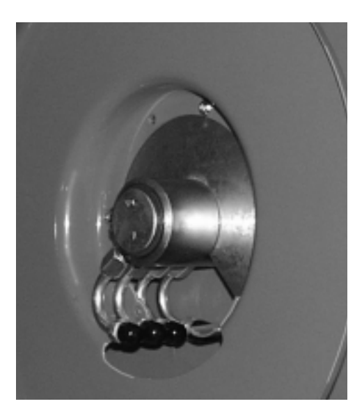
"Goose-necks" plus integral ramp assure smooth hose transition between manifold and reel spool.