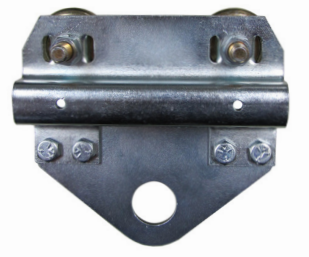
S-Beam: F-IT-B-S3/5.7-TB W-Beam: F-IT-W-TB

Intermediate or Tow Trolley with dual cable saddles