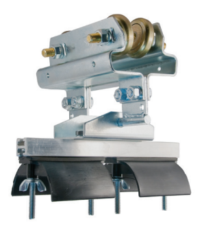
S-Beam Flat Cable: F-IT-S3/5.7D W-Beam Flat Cable: F-IT-WD

Intermediate or Tow Trolley with dual cable saddles