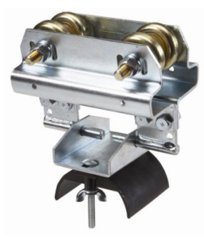
S-BEAM Intermediate or Tow Trolley

Our ADJUSTABLE BEAM TROLLEYS are designed with your applications in mind. Economical, durable and expandable, our festoon cable trolley runs on various beam sizes (See below for listing; consult factory for additional size requirements). These trolleys roll on 4 steel ball bearing wheels. This provides a rolling capacity of 154 lbs. Multiple cable saddle configurations provide a variety of cable carrying options for single or dual flat cable or round cable.