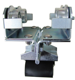
W-BEAM Intermediate or Tow Trolley

-Wheels are manufactured with threaded axels, bolted (not riveted) onto the chassis for easy replacement if required