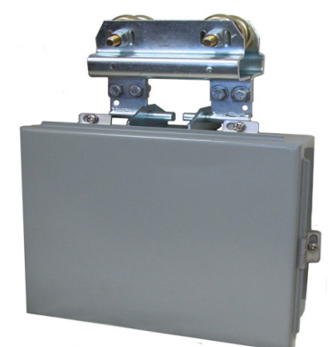
S-Beam: F-ITB-S3/5.7 W-Beam: F-ITB-W

Control Box Trolley for Push Button Pendant connection