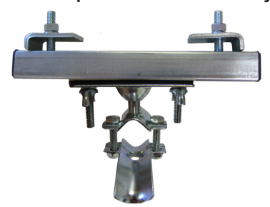
F-ICE/R2 - 0.60"-0.94" dia Round F-ICE/R3 - 0.94"-1.25" dia Round F-ICE - single saddle 3" dia Flat F-ICE-D - dual saddle 3" dia Flat