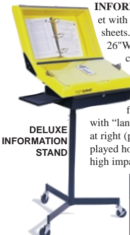
DELUXE INFORMATION STAND

INFORMATION STAND features a 4" deep drop pocket with 3-ring binder mechanism that will hold up to 250 sheets. Binder pocket has hinged, clear plastic cover. 26"W x 13"H inclined writing surface includes two clips and hinged, clear document protector. Standard model includes steel pedestal with glides. Deluxe unit includes casters, lockable tray, and side tray. Writing surface is 38" high. Also available with "landscape" drop pocket panel, shown at right (panel is vertical so pages are displayed horizontally). Panels are yellow high impact polystyrene.