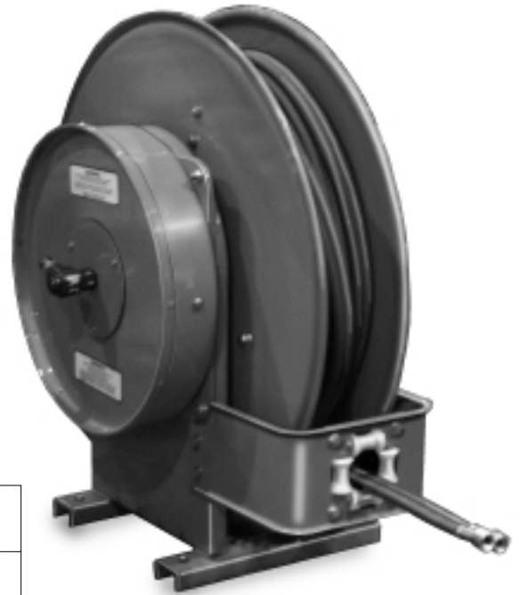
Model H60 oxygen-acetylene reel. Hose guide with rollers is standard. Hose not included, but may be ordered from and installed by Gleason.