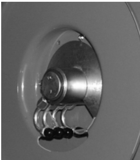
"Goose-necks" plus integral ramp assure smooth hose transition between manifold and reel spool.